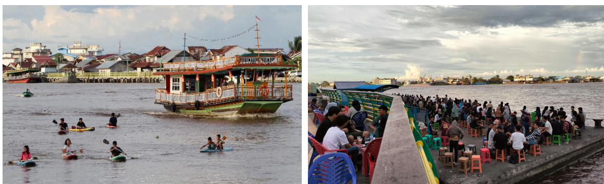
Figure 2. Kapuas River as a shared socio-cultural space supporting social interaction and intercultural communication among multiethnic communities in Pontianak City.

Beyond shaping social relations among residents, the Kapuas River also functions as an important socio-cultural space influencing communication patterns and community activities within Pontianak's multicultural society. Economic activities such as traditional trading, river tourism, and water transportation create high levels of social encounter within the riverbank environment. Observational findings indicated that residents from various ethnic groups utilise the same communal spaces without demonstrating rigid social segregation in their daily activities. Such naturally occurring interaction patterns facilitate more open and inclusive intercultural communication among communities. In this context, the Kapuas River serves not only as a geographical and economic resource but also as a shared social environment connecting multiple cultural identities within Pontianak society. The river's presence as a communal living space contributes significantly to the construction of collective identity among Kapuas Riverbank communities as a multicultural society characterised by relatively harmonious social relationships.