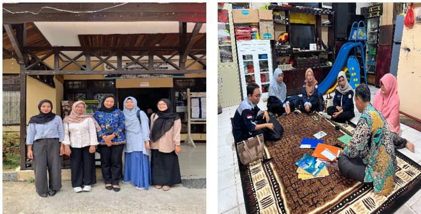
Figure 1. (a) Field observation activities conducted in Kampung Wisata Benua Melayu Laut; (b) Interview activities with members of POKDARWIS during the data collection process.

This statement illustrates that social interaction within the Kapuas Riverbank community is characterised by adaptive and kinship-oriented relationships. Ethnic diversity is not perceived as a social boundary creating separation among groups; rather, it is understood as an inseparable aspect of the multicultural social reality historically formed within riverbank society. Continuous and sustained social interaction strengthens social cohesion and contributes to the development of harmonious interethnic relations among community members. Findings from field observations and interviews are presented in Figure 1.